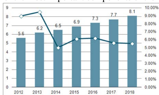
Figure 2 Analysis of China's network user scale and growth rate

As of 2018, the number of Internet users in China had reached 810 million, an increase of 3.8 percent over the end of 2017, and the Internet penetration rate of 57.7 percent. With the rapid development of the digital culture industry, the number of Internet video users in China reached 759 million, up 39.91 million from the end of 2018, accounting for 88.8 percent of the total. In addition, according to the 2018 China Network Audio-visual Development Research Report, the national network video content market in 2018 is about 201.68 billion yuan, compared with the 2018 60.976 billion yuan national box office, the network video market scale has far exceeded the traditional film industry, becoming one of the most important components of the Chinese cultural industry.