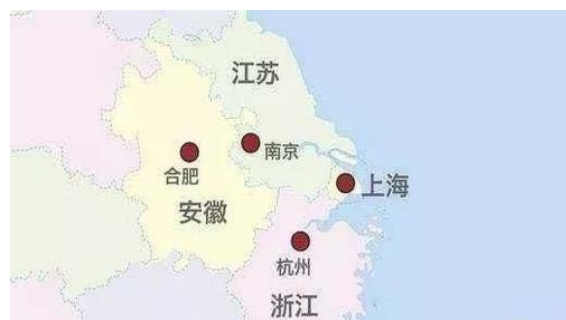
Figure 3 Industrial cluster of digital economy in Yangtze River Delta

Industrial clusters rely on internal networks to promote the rapid development of the local regional economy. Industrial cluster is an important way to promote regional economic development, an important way to realize regional innovation system, and also an important way to enhance regional competitiveness. However, due to the different level of economic development in different parts of China, the degree of economic development of digital culture industry is different. As shown in figure 3, the economic cluster of digital culture industry in the developed Yangtze River Delta region is good. However, in the economically underdeveloped areas, the digital culture industry is small in scale and the market competitiveness is small, which cannot form an industrial park, and it is difficult to form an industrial cluster with complementary advantages, industrial cooperation and benefit sharing, which greatly limits the overall development of the digital culture economy in our country.